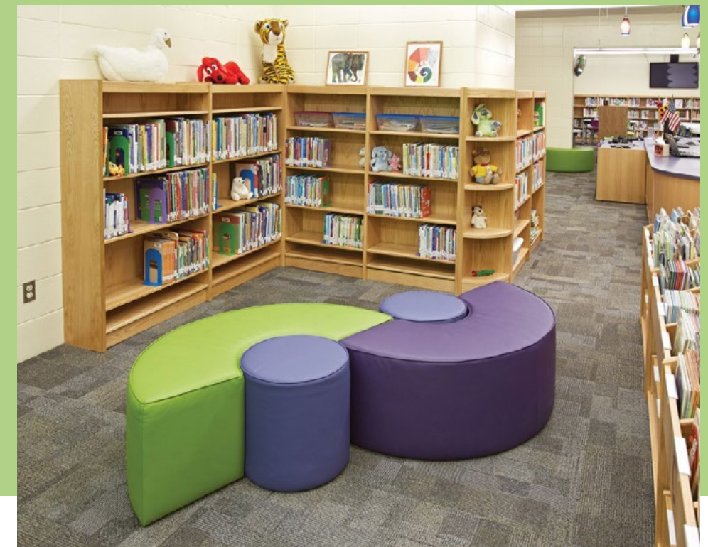
Bloom & Durecon Wood