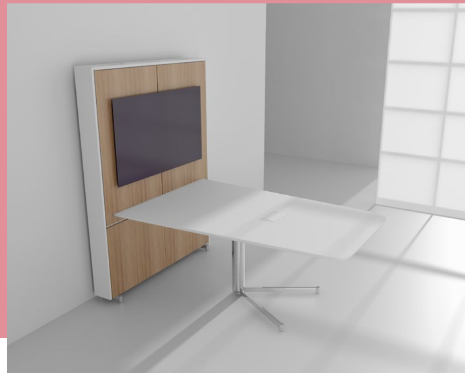
Palmieri Social Media®