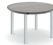
Round (in Diameter) 36", 42", 48", 54", 60"

The Fluid Table series is available in the following shapes and sizes: