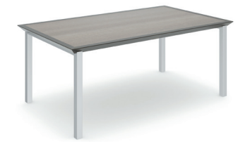
Rectangle (in width x depth) 30" Depth: 36", 42", 48", 54", 60", 72" 36" Depth: 42", 48", 54", 60", 72"