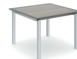
Square (in width x depth) 36", 42", 48"